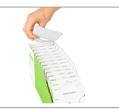
As a counter display: Bend the rear flap at the fold, straighten it and fix it in the cardboard cut-out