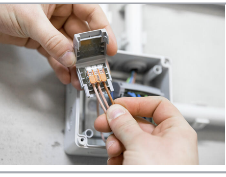
Place the wired connector in the Gelbox.