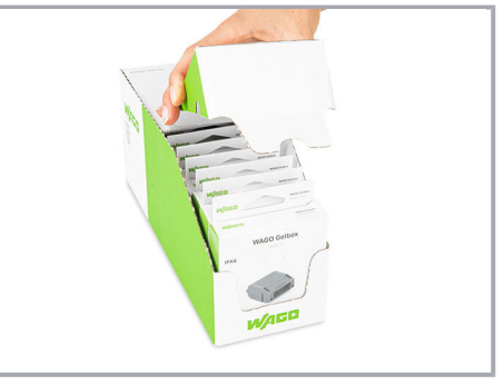
Tear off the cover from the perforation.

Subject to changes. Please also observe the further product documentation!