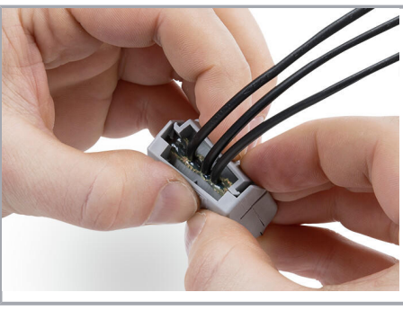
Close latch securely.